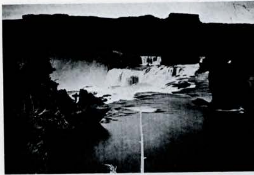
Timothy O'Sullivan. Shoshone Falls (Idaho). 1868.

These micromuscular efforts are the kinesthetic counterpart to the sheerly optical illusion of the stereograph. They are a kind of enactment, on a very reduced scale, of what happens when a deep channel of space is opened before one. The actual readjustment of the eyes from plane to plane within the stereoscopic field is the representation by one part of the body of what another part of the body (the feet) would do in passing through real space. From this physio-optical traversal of the stereo field derives another difference between it and pictorial space. This difference concerns the dimension of time.