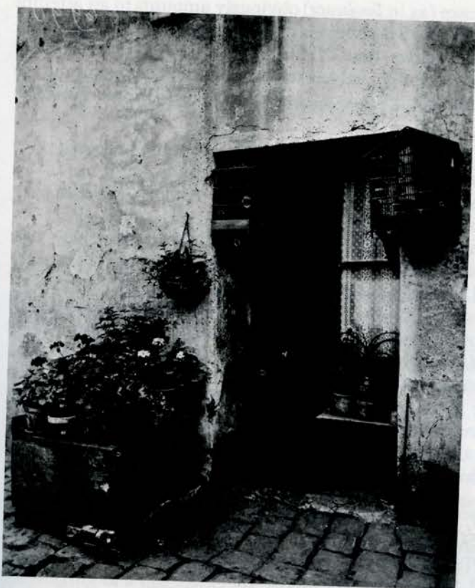
Eugène Atget. Sceaux. 1922. Printing-out paper , 9-7/16 by 7-1/16 inches. Collection, The Museum of Modern Art, New York.

age of a façade separated by months or even years from the view of the same building's doorway or window mullions or wrought-iron work. The answer, it seems, lies less in the conditions of aesthetic success or failure than in the requirements of the catalogue and its categorical spaces.