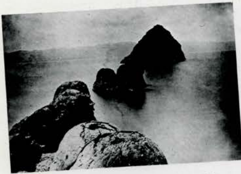
Timothy O'Sullivan. Tufa Domes, Pyramid Lake (Nevada). 1868.