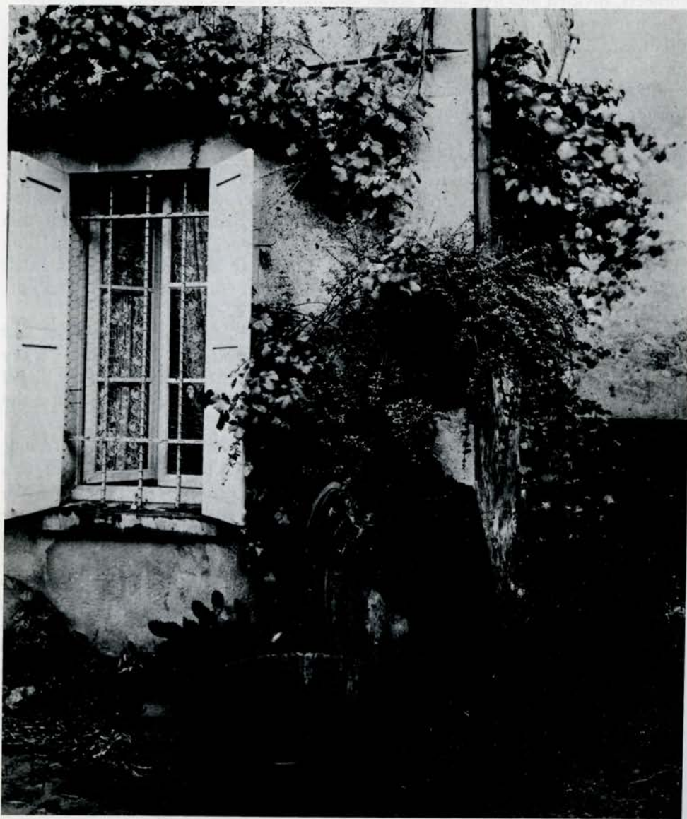
Eugène Atget. Verrières, coin pittoresque. 1922. Printing-out paper, 9-7/16 by 7-1/16 inches.