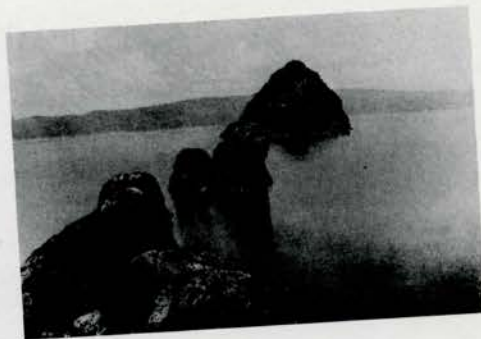
Photolithograph after O'Sullivan, Tufa Domes, Pyramid Lake. (Published in King Survey report, 1875).

been carefully re-created, so that gravity and direction are restored to this space formerly awash with the vague luminosity of too rapidly exposed collodion.